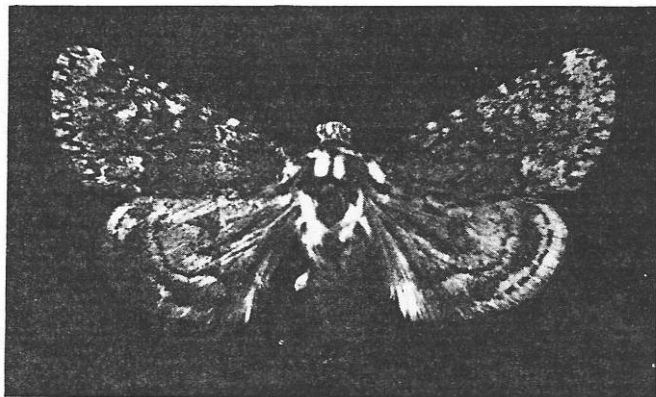
Fig. 1: Cryphia seladonia burgefii Draudt, Bulgaria, Kozuch, 14-ix-1983, leg. and coll. J. GANEV.