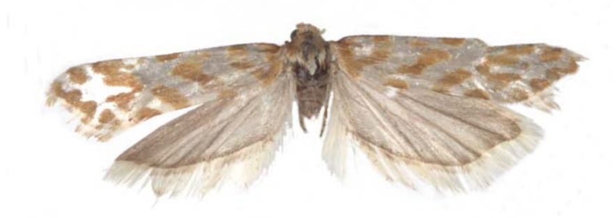
Fig. 1: Aethes margaritifera Falkovitch, 1963, Turkey, Erzurum, Atatürk Üniversitesi Campus, 1850–1900m, 25.VII.1996, leg. H. Özbek, coll. F. Groenen (Photograph: Jurate De Prins).

The campus is quite a large area at an altitude of 1850–1900 m. The whole area consists of uncultivated lawns and meadows, sparsely wooded with pine ( Pinus sylvestris L.), beech ( Fagus sp.), oak ( Quercus sp.), ash ( Fraxinus sp.), willow ( Salix sp.) and several unidentified species of bushes. The roughest climate of Turkey prevails in this area. The winters are cold and the summers are hot and dry. The annual average temperature is 6 °C.