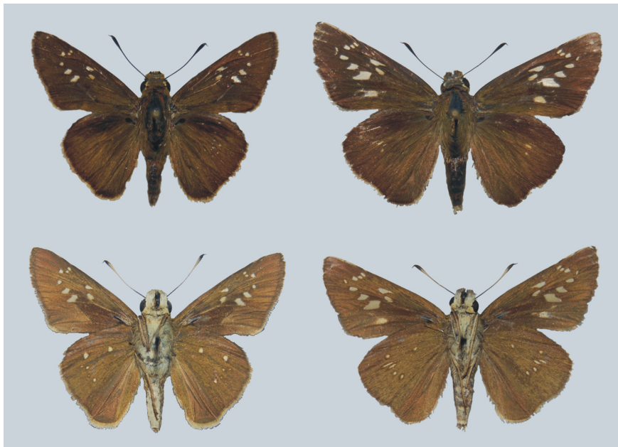
Fig. 3. Left: upperside and underside of male Pelopidas thrax , Troulos, 23.ix.2007; Right: upperside and underside of female Pelopidas thrax , Kefalos, 25.ix.2007.

For other Greek islands, Dennis et al. (2001) give distribution predictions for P. thrax from a model based on geographical variables. For the already well studied islands, this model predicts, with >50% probability, the occurrence of P. thrax on Megisti (= Kastellórizo) and Simi. For the poorly studied islands the probability was >50% only for the island of Halki.