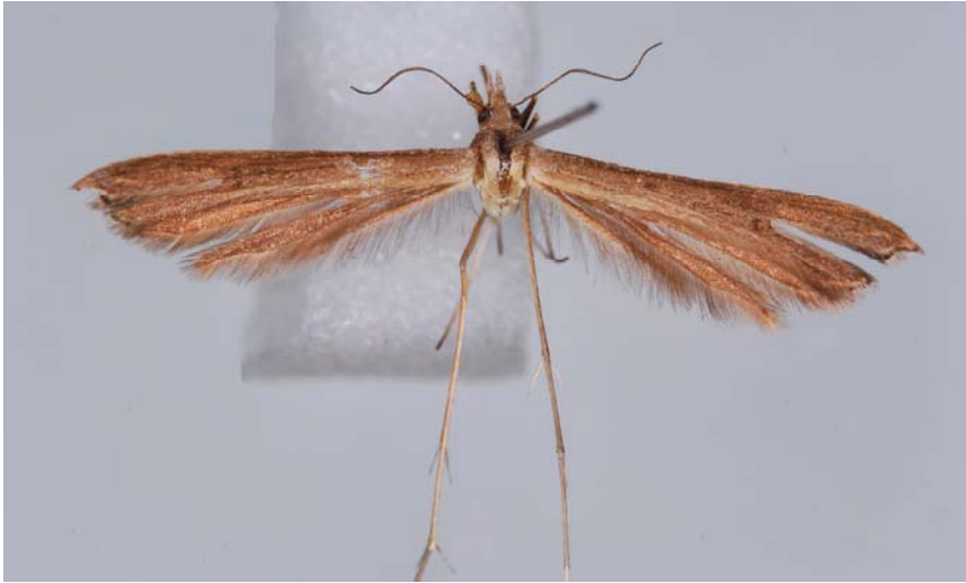
Fig. 1: Stenoptilia garveoeti spec. nov. Holotype. Nepal, Humla, 42 km NW Simikot, 30°07'26"N 81°24'04"E, 3950 m, 14.vii.2008 (T. & J. Garveoet).