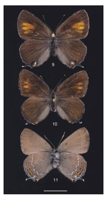
Figs 9-11. Male Satyrium ilicis from Greece, Sími Island, Pédi, near sea level, 24.iv.2010. 9, 10. —Upperside. 11. —Underside. 9. — White spot near HW anal angle due to dried abdominal fluid. Scale bar equal to 1 cm.