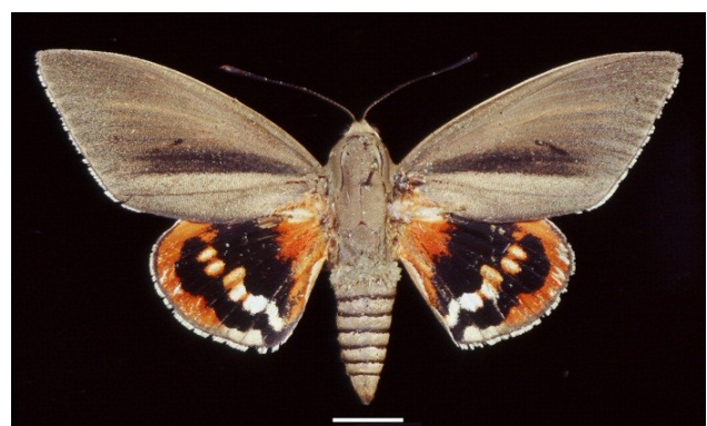
Fig. 3. Male Paysandisia archon (Burmeister, 1800), Greece, Páros Island, Voutákos, sea level, 15–18.vii.2010. Scale bar 1 cm.