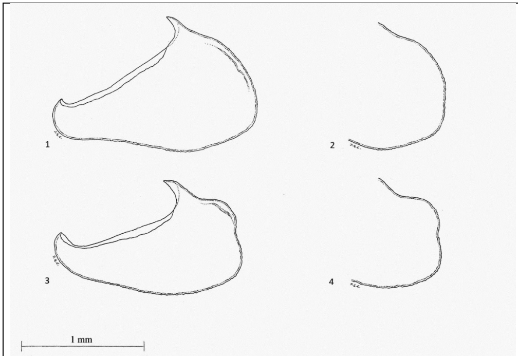
Figs. 1–4 . Genitalia components of Pontia species. 1, 2. P. beckerii . USA, California, Alpine Woodfords, 5800 ft., 14.viii.2003. 3, 4. P. chloridice . Greece, Thráki, near Pessáni, 110 m, 29.vi.1991. 1, 3. Lateral aspect of inner face of right valva. 2, 4. Flat aspect of inner face of distal end of right valva.