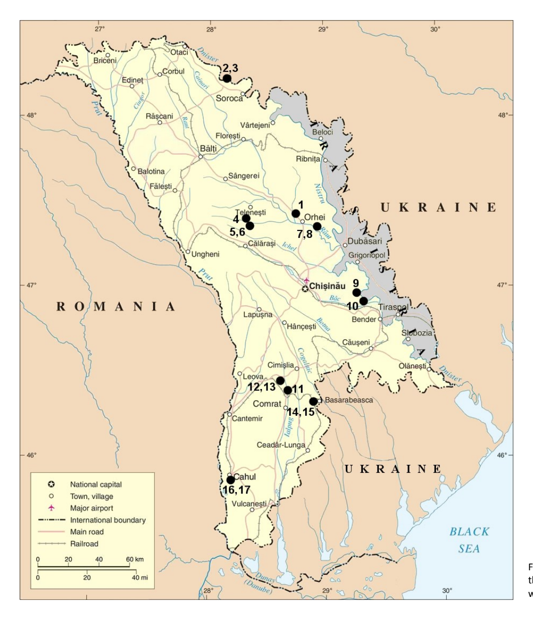
Figure 1. Map of Moldova with the visited localities marked with black dots and numbers.