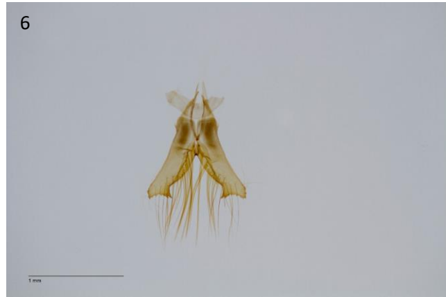
Fig. 5. Genital preparation of Z. knysna . Puerto Rico, Gran Canaria, Spain. 7.iii.1993. Leg. Flemming Vilhelmsen. Photo © Mikkel Høegh Post. Fig. 6. Genital preparation of Z. karsandra. Kokkinos Pirgos, Crete, Greece. 19.vi.2018. Leg. Arne Lykke Viborg. Photo © Mikkel Høegh Post.