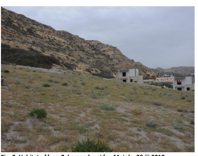
Fig. 2. Habitat of/van Z. karsandra at/op Matala, 28.iii.2018.