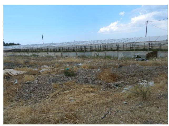
Fig. 3. The greenhouse and surroundings at Kokkinos Pirgos 19.vi.2018.

Fig. 3. De serre en omgeving van Kokkinos Pirgos 19.vi.2018.