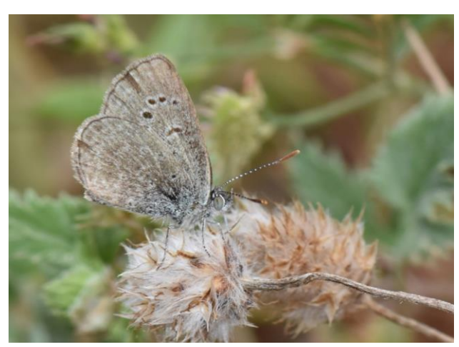
Fig. 1. Z. karsandra at/op Matala 28.iii.2018.

four worn specimens of Z. karsandra were recorded at Matala (figs. 1–2). Also the area around the Port of Kokkinos Pirgos was investigated and here suitable host-