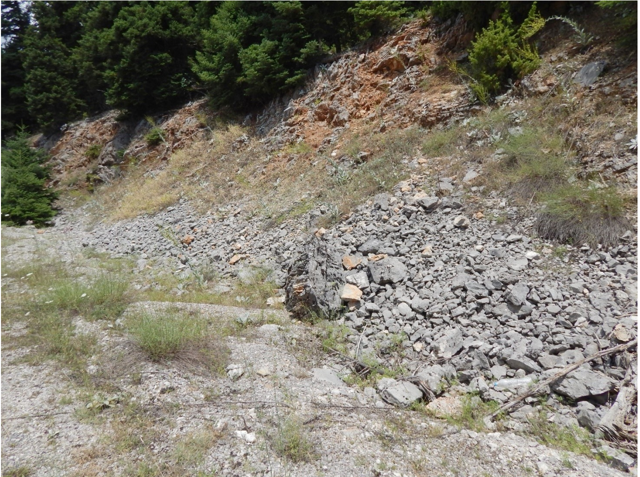
Fig. 1. New locality of Polyommatus timfristos : Dry rocky hillside along the road at Ágia Stilianós, Fthiótida district. © Morten S. Mølgaard.